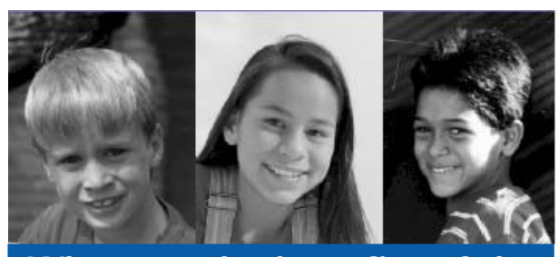
What are the benefits of the Wisconsin Immunization Registry?

The Wisconsin Immunization Registry (WIR) is a secure computerized data system that tracks the immunizations given to people in Wisconsin. By keeping a record of the immunizations given, health care providers, parents and legal guardians know if and when a child had been given a vaccine. This helps with keeping children upto-date on all needed vaccines.